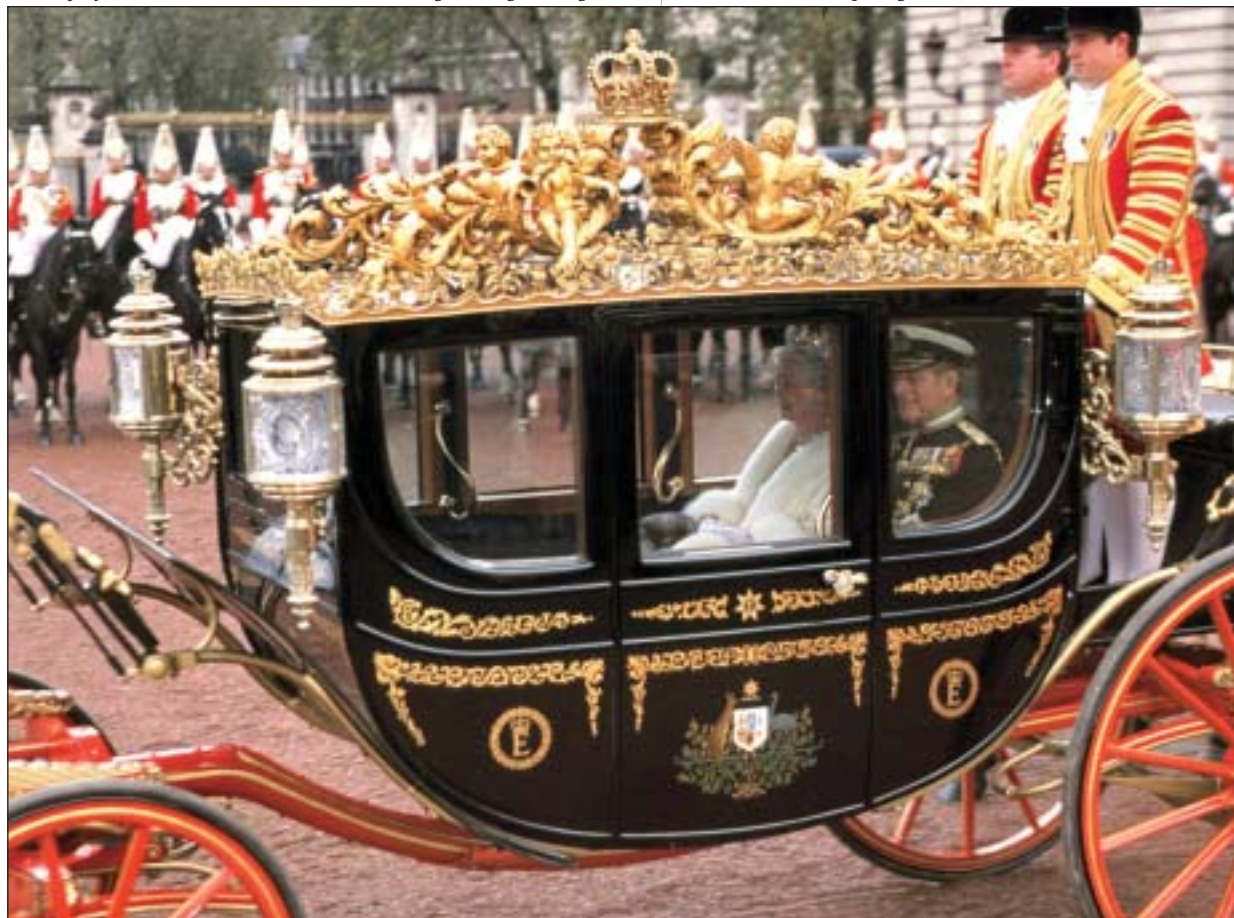
Her Majesty The Queen with HRH Duke of Edinburgh leaving Buckingham Palace Forecourt for State Opening of Parliament