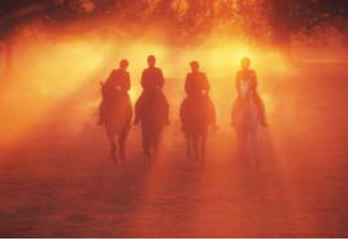
Early Morning Riders (Awarded Best of View of Britain at 6 a.m. by BBC Radio 4/Today Program)