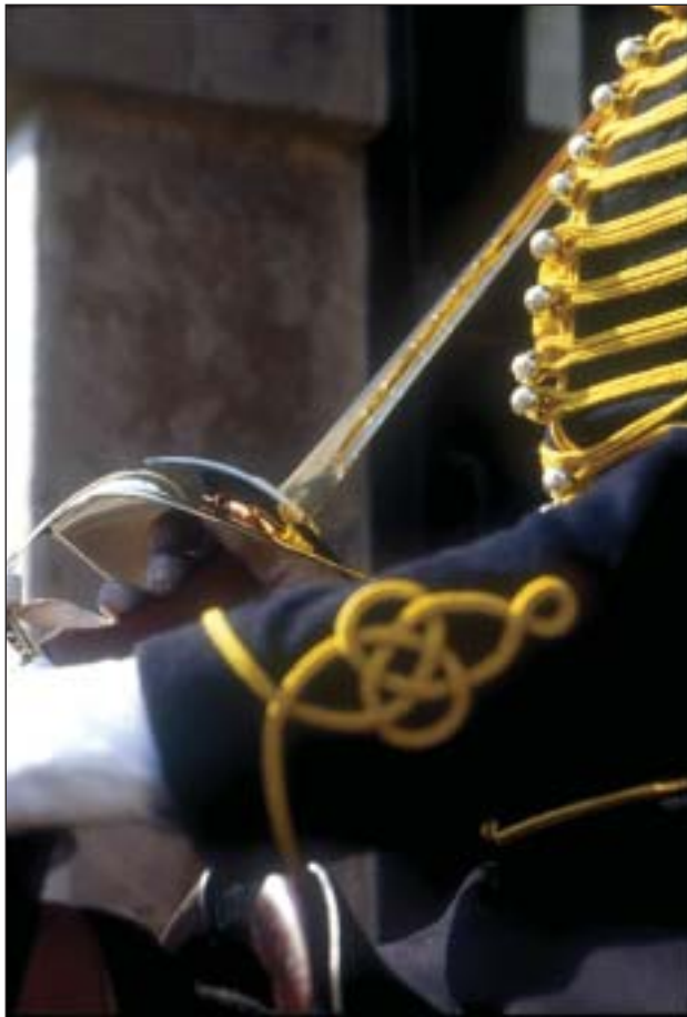
King's Troop Royal Horse Artillery, Guard Duty