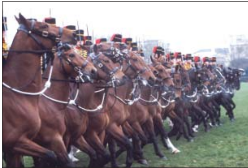
Eyes Right! King's Troop Royal Horse Artillery

On the cover: The Household Cavalry at St. Paul's Cathedral during Lord Mayor's Show